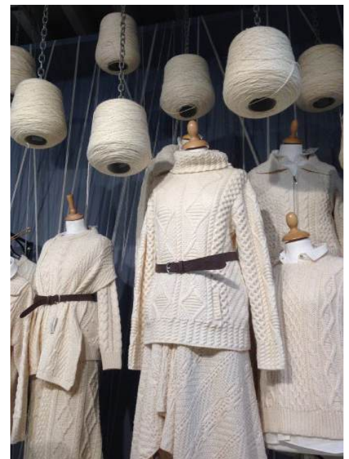
Fine Irish Wool