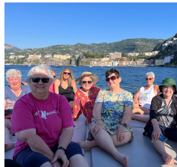
The Amalfi Coast