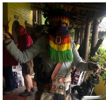
Me - in a local Costume