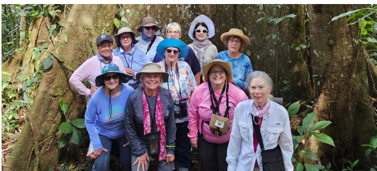
Amazon Forest Adventure