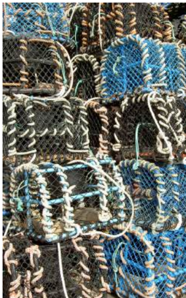
Crab and Lobster Pots

After a filling breakfast, we are off to enjoy a Boston city tour featuring Boston Commons, the Old State House, and Old North Church, where Paul Revere got the signal to start his famous ride, the Old South Meeting House, Beacon Hill, and Old Ironsides. We will visit the Faneuil Hall Marketplace (also called Quincy Market), located in downtown Boston near the waterfront and originally gifted to the city in 1742. This fun place is set around a cobblestone promenade where jugglers, magicians, and musicians entertain passers-by. Shops offering the perfect blend from antiques to the latest fashions. This world-famous Food Colonnade features thirty food merchants representing cuisine from around the globe that will tease your tastebuds. Later we depart Boston and travel to Plymouth. We will Pilgrim's 1627 village, where costumed interpreters visit