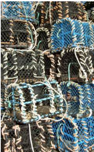
Crab and Lobster Pots

After a filling breakfast, we are off to enjoy a Boston city tour featuring Boston Commons, the Old State House, and Old North Church, where Paul Revere got the signal to start his famous ride, the Old South Meeting House, Beacon Hill, and Old Ironsides. We will visit the Faneuil Hall Marketplace (also called Quincy Market), located in downtown Boston near the waterfront and originally gifted to the city in 1742. This fun place is set around a cobblestone promenade where jugglers, magicians, and musicians entertain passers-by. Shops offering the perfect blend from antiques to the latest fashions. This world-famous Food Colonnade features thirty food merchants representing cuisine from around the globe that will tease your tastebuds. Later we depart Boston and travel to Plymouth. We will Pilgrim's 1627 village, where costumed interpreters visit