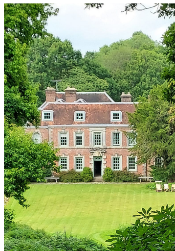
Penns in the Rocks