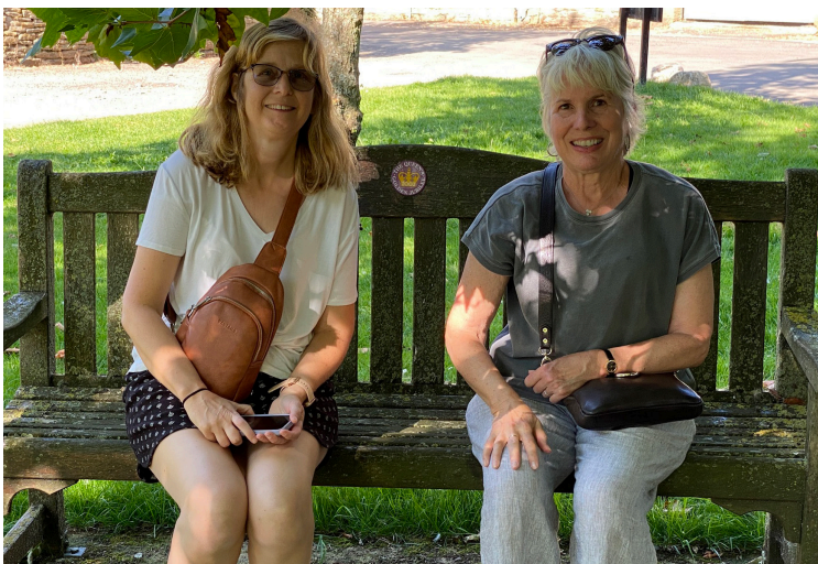
Take a seat on the Queen's Golden Jubilee bench!

Susan Dinsmore Traveler England - Castles and Gardens Tour 2024