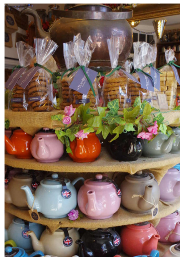
Always time for tea!