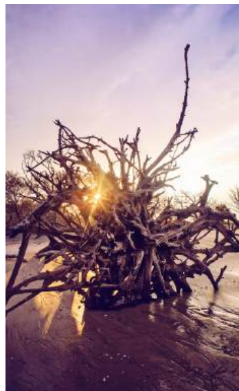
Jekyll Island Driftwood

B = Breakfast L = Lunch D = Dinner C = Cocktail