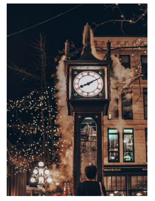
December 2, 2025 - Tuesday Arrive in Vancouver

Arrive in the seaport city of Vancouver, the crown jewel of Western Canada. Considered one of the most beautiful cities in North America. Vancouver dazzles during the Christmas holiday season along with views of the Pacific Ocean, majestic mountains and a glittering skyline. Meet your local Tour Director and transfer to the stunning Fairmont Hotel Vancouver, known as the 'Castle in the City' and has been the pinnacle of elegance since its debut in 1939. Check-in for a two-night stay and Enjoy getting to know your fellow travelers this evening at a delicious Welcome Dinner. (D)