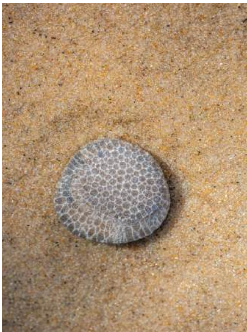
Pretty Petoskey Stone