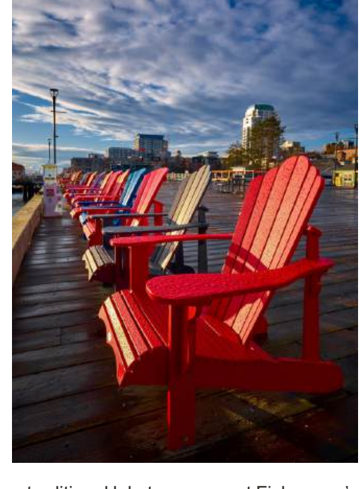
After lunch, continue to explore the area at your own pace, soaking in the beautiful surroundings. B | D