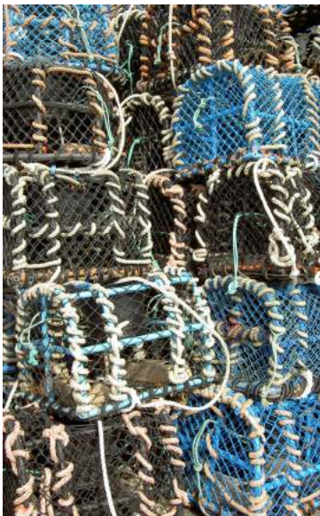
Crab and Lobster Pots

After a filling breakfast, we are off to enjoy a Boston city tour featuring Boston Commons, the Old State House, and Old North Church, where Paul Revere got the signal to start his famous ride, the Old South Meeting House, Beacon Hill, and Old Ironsides. We will visit the Faneuil Hall Marketplace (also called Quincy Market), located in downtown Boston near the waterfront and originally gifted to the city in 1742. This fun place is set around a cobblestone promenade where jugglers, magicians, and musicians entertain passers-by. Shops offering the perfect blend from antiques to the latest fashions. This world-famous Food Colonnade features thirty food merchants representing cuisine from around the globe that will tease your tastebuds. Later we depart Boston and travel to Plymouth. We will Pilgrim's 1627 village, where costumed interpreters visit