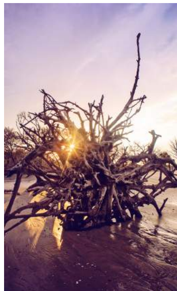
Jekyll Island Driftwood

B = Breakfast L = Lunch D = Dinner C = Cocktail