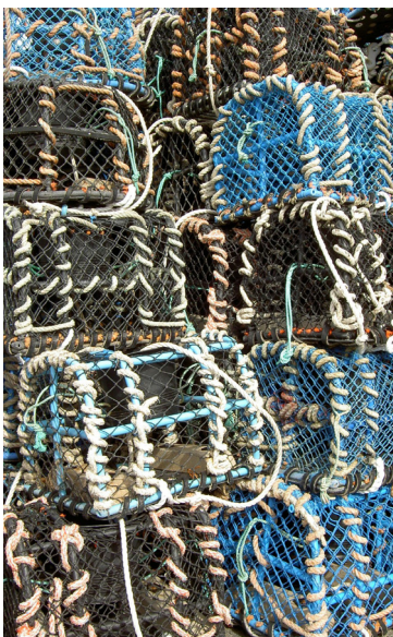
Crab and Lobster Pots

After a filling breakfast, we are off to enjoy a Boston city tour featuring Boston Commons, the Old State House, and Old North Church, where Paul Revere got the signal to start his famous ride, the Old South Meeting House, Beacon Hill, and Old Ironsides. We will visit the Faneuil Hall Marketplace (also called Quincy Market), located in downtown Boston near the waterfront and originally gifted to the city in 1742. This fun place is set around a cobblestone promenade where jugglers, magicians, and musicians entertain passers-by. Shops offering the perfect blend from antiques to the latest fashions. This world-famous Food Colonnade features thirty food merchants representing cuisine from around the globe that will tease your tastebuds. Later we depart Boston and travel to Plymouth. We will Pilgrim's 1627 village, where costumed interpreters visit