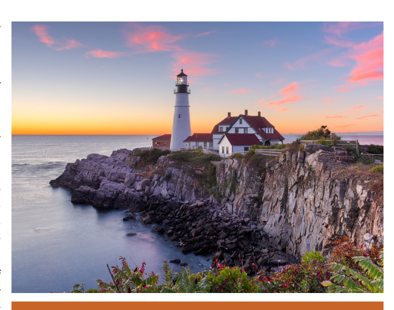
Portland Head Light