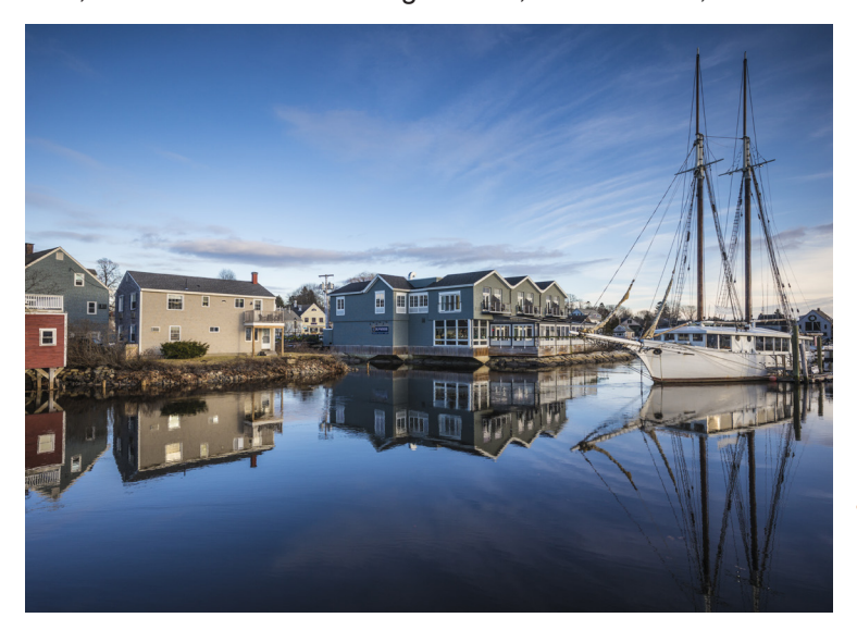
Village Harbor View

Historic Boston – Fenway Park - Ogunquit / Kennebunkport After a filling breakfast, it is time to enjoy a Boston city tour featuring Boston Commons, the Old State House, Old North Church where Paul Revere got the signal to start his legendary ride, the Old South Meeting House, Beacon Hill, and Old