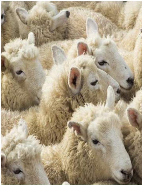
Sheep, Sheep, and more Sheep