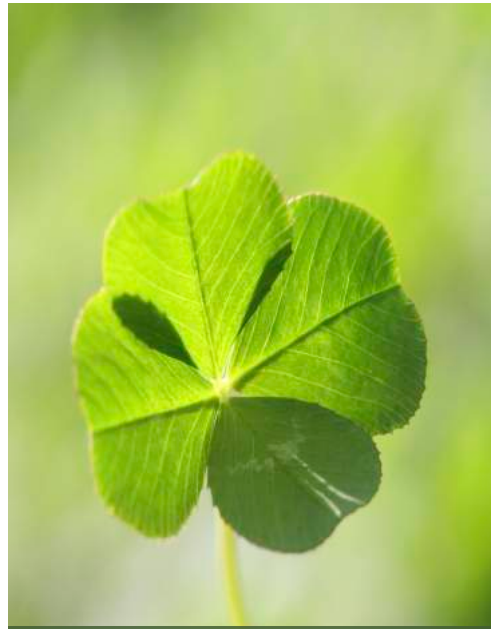
The Luck of the Irish