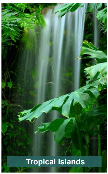
February 25, 2022 - Saturday