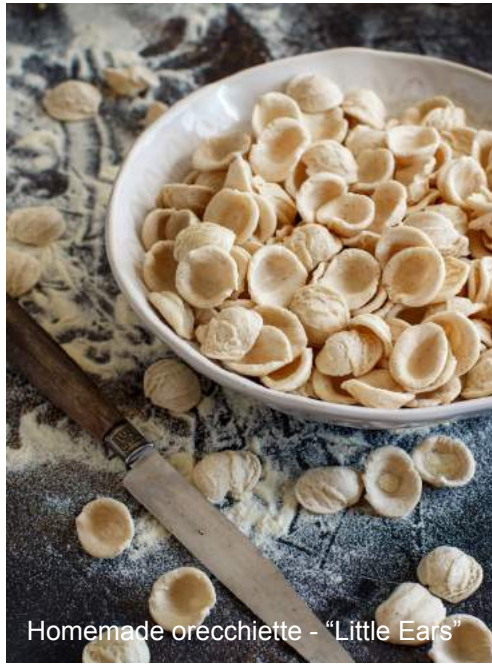
Homemade orecchiette - "Little Ears"