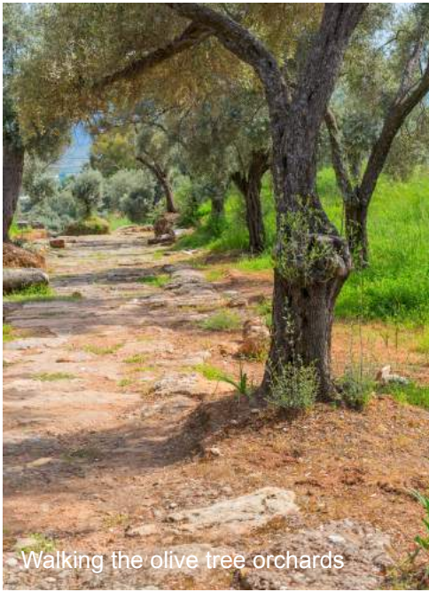
Walking the olive tree orchards